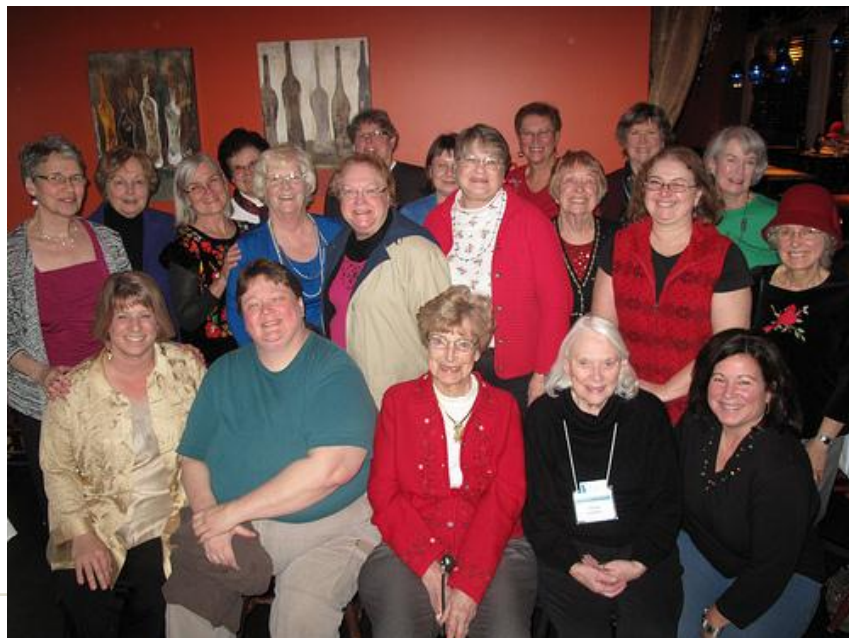
Holiday 2012 Gathering