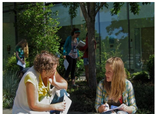
Visiting the Tech trekkies