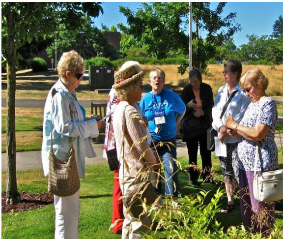
AAUW Members at Tech Trek 2013

Editor's Note: See the article just after the President's Corner for more information on this year's Tech Trek.