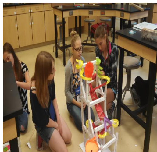
Building a roller coaster