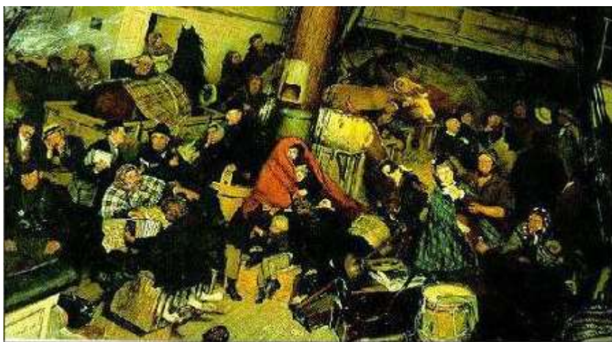
Knut Ekwall. Emigrants .