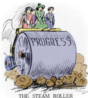
THE STEAM ROLLER

Women were not granted the right to vote in Massachusetts until after the 19th amendment in 1920.