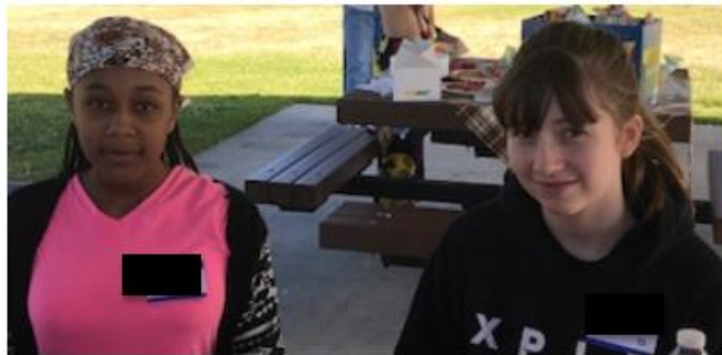
Tech Trek Meet & Greet Picnic June 26, 2018 Faces of Tech Trek Tacoma 2018 Camp Season

support of this vital Branch activity that creates opportunity and a better future for girls and women.