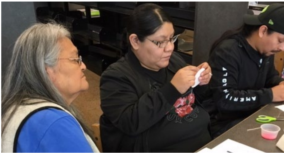
Attendees work on ornaments that support the tribal cultural heritage, such as small paper canoes and finely beaded badges.

You are invited to learn more about Chief Leschi at their website .