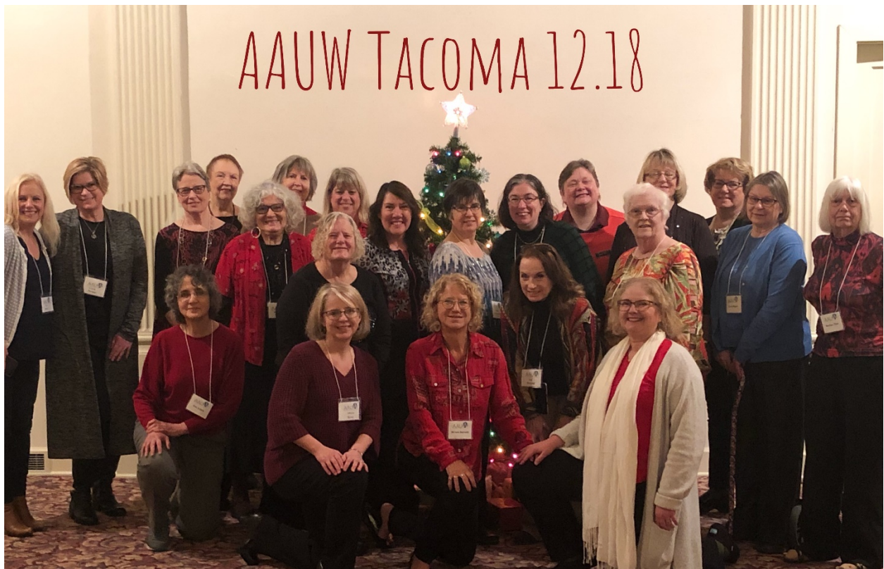
Festive Feminists Frolic and Feast together at the 2018 AAUW Tacoma Branch Holiday Luncheon