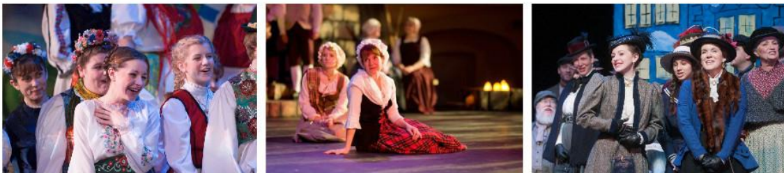
The Christmas Revels – A Celebration of the Winter Solstice