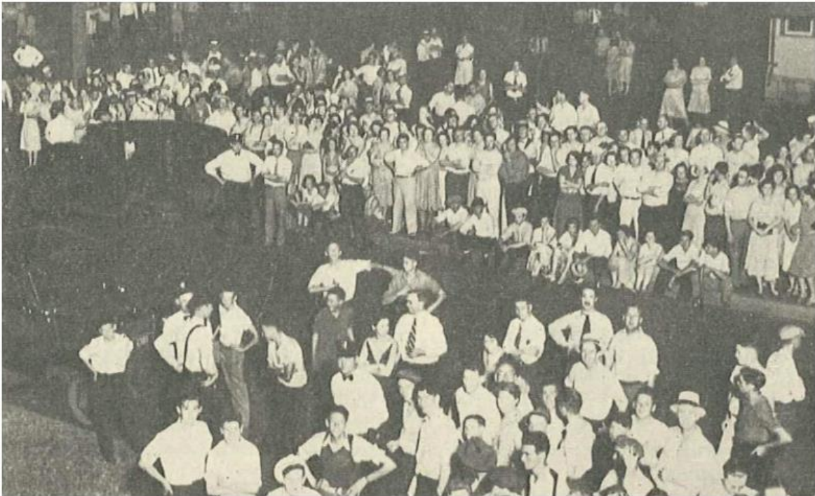
Crowd of people (mob) in front of 4600 Columbus Ave South (The Crisis, October 1931)

These riots lasted MONTHS — MONTHS! -- and they worked. The Lees moved out in 1933.